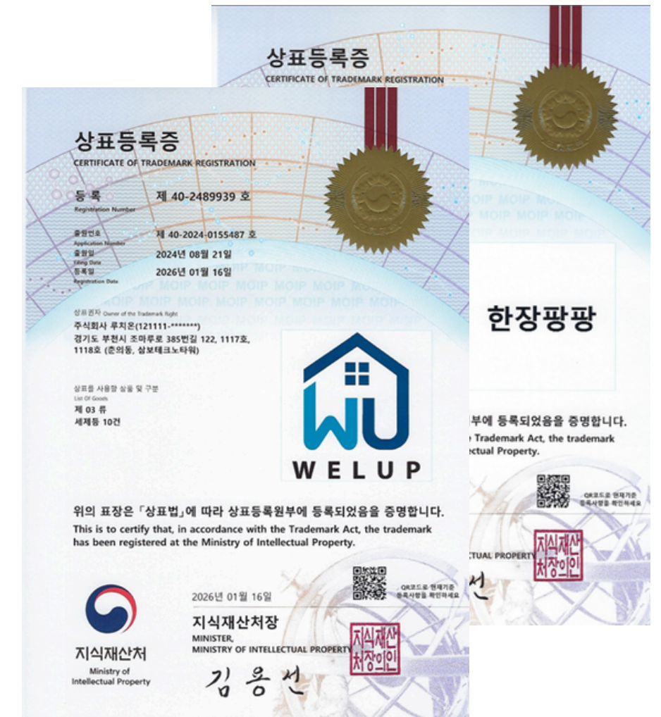
Trademarks 한장팡팡 & WELUP