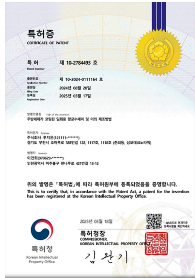
Patent No. 10-2784493 Disposable antibacterial scrubber coated with dish detergent and its manufacturing method.